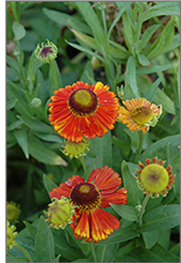
Sahin's Early Flowerer Sneezeweed flowers

This plant will require occasional maintenance and upkeep, and should be cut back in late fall in preparation for winter. It is a good choice for attracting butterflies to your yard, but is not particularly attractive to deer who tend to leave it alone in favor of tastier treats. Gardeners should be aware of the following characteristic(s) that may warrant special consideration;