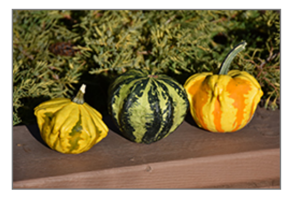
Ornamental Gourd fruit