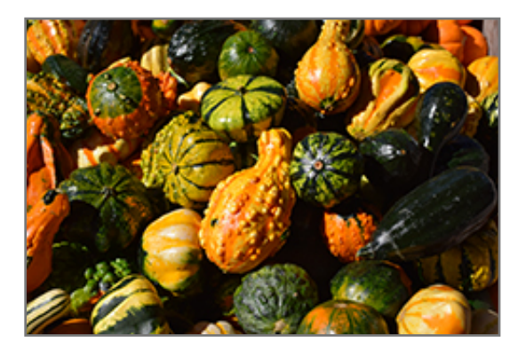
Ornamental Gourd fruit