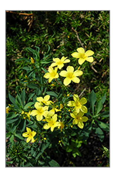
Dwarf Perennial Flax flowers

Dwarf Perennial Flax will grow to be about 12 inches tall at maturity, with a spread of 12 inches. When grown in masses or used as a bedding plant, individual plants should be spaced approximately 8 inches apart. It grows at a fast rate, and under ideal conditions can be expected to live for approximately 3 years. As an herbaceous perennial, this plant will usually die back to the crown each winter, and will regrow from the base each spring. Be careful not to disturb the crown in late winter when it may not be readily seen!