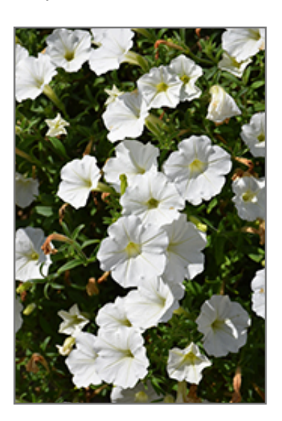
Supertunia Vista Snowdrift Petunia flowers