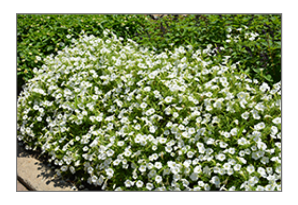
Supertunia Vista Snowdrift Petunia in bloom

This plant will require occasional maintenance and upkeep. Trim off the flower heads after they fade and die to encourage more blooms late into the season. It is a good choice for attracting butterflies and hummingbirds to your yard, but is not particularly attractive to deer who tend to leave it alone in favor of tastier treats. It has no significant negative characteristics.