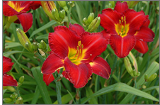
Chicago Apache Daylily flowers

Rich scarlet red flowers with slightly ruffled edges bloom during the mid summer months; tall flower stalks rise above mounds of green arching foliage; an elegant addition to borders, beds and containers; low maintenance and drought tolerant