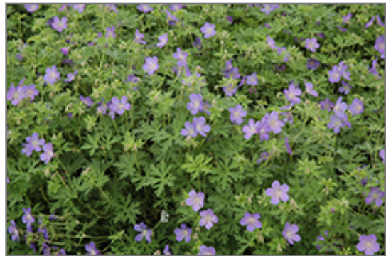
Johnson's Blue Cranesbill in bloom