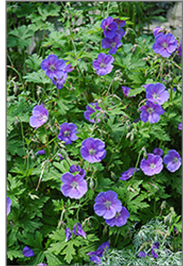
Johnson's Blue Cranesbill flowers

Johnson's Blue Cranesbill is recommended for the following landscape applications;