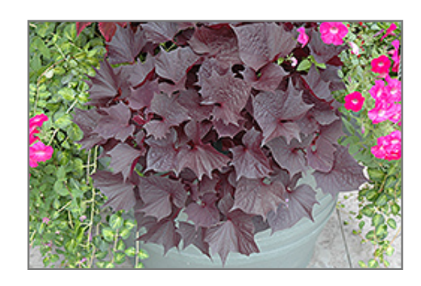
Sweet Caroline Bewitched Sweet Potato Vine foliage

Sweet Caroline Bewitched Sweet Potato Vine is primarily valued in the home for its spreading and trailing habit of growth. Its attractive spiny heart-shaped leaves remain deep purple in colour throughout the year.