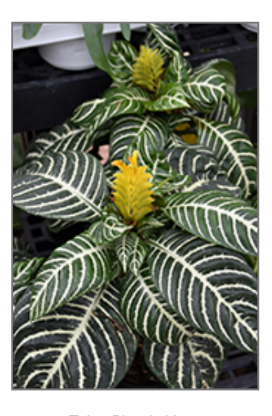
Zebra Plant in bloom

When grown indoors, Zebra Plant can be expected to grow to be about 24 inches tall at maturity extending to 3 feet tall with the flowers, with a spread of 24 inches. It grows at a medium rate, and under ideal conditions can be expected to live for approximately 10 years. This houseplant should only be grown away from direct sunlight or in a room with strong artificial light. It prefers to grow in average to moist soil. The surface of the soil shouldn't be allowed to dry out completely, and so you should expect to water this plant once and possibly even twice each week. Be aware that your particular watering schedule may vary depending on its location in the room, the pot size, plant size and other conditions; if in doubt, ask one of our experts in the store for advice. It is not particular as to soil type or pH; an average potting soil should work just fine.