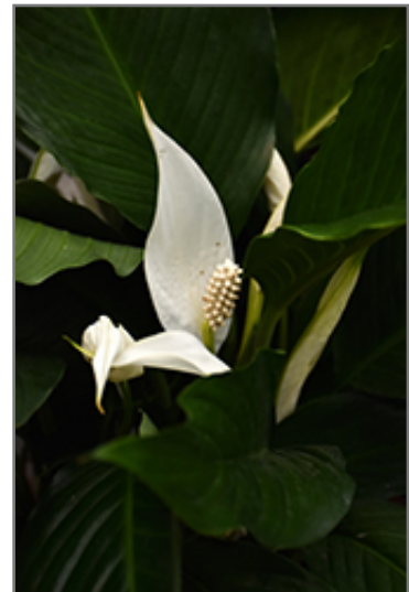
Peace Lily flowers