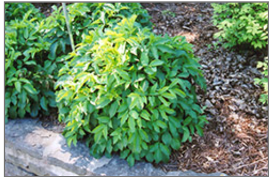
Dwarf European Elder