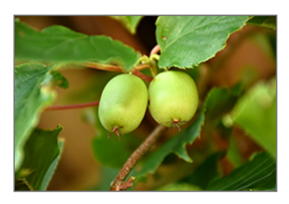
Issai Hardy Kiwi fruit

Aside from its primary use as an edible, Issai Hardy Kiwi is sutiable for the following landscape applications;