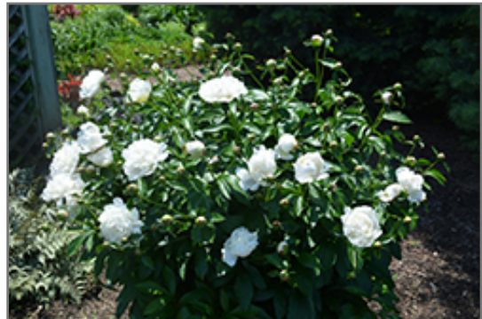
Festiva Maxima Peony in bloom