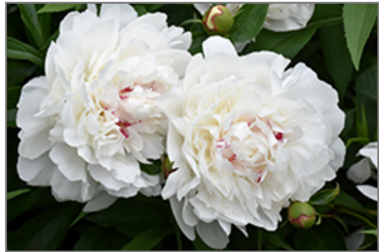
Festiva Maxima Peony flowers

Festiva Maxima Peony is recommended for the following landscape applications;