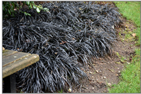
Black Mondo Grass

Black Mondo Grass is recommended for the following landscape applications;