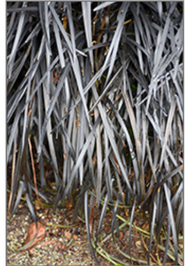
Black Mondo Grass foliage

* This is a 'special order' plant - contact store for details