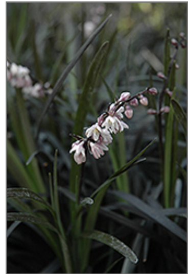
Black Mondo Grass flowers