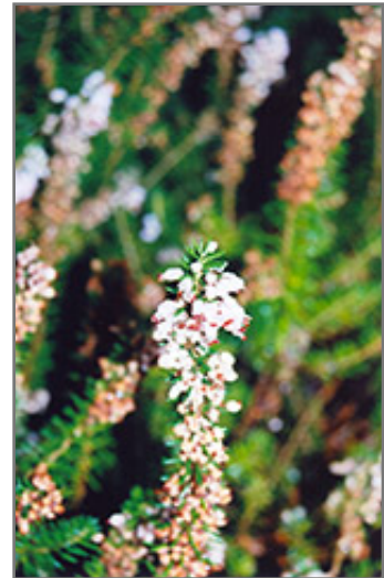
Scotch Heather flowers