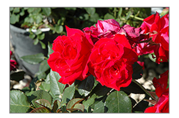
Mv Hero Rose flowers