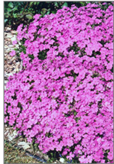
Arctic Phlox flowers