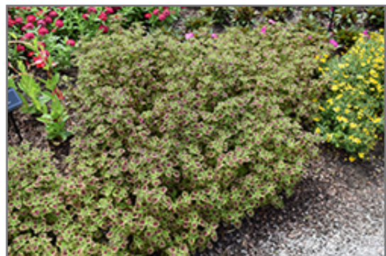
ColorBlaze Chocolate Drop Coleus