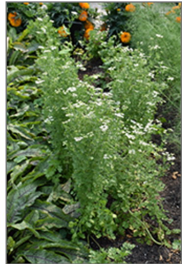
Santo Cilantro in bloom

This plant is typically grown in a designated herb garden. It does best in full sun to partial shade. It does best in average to evenly moist conditions, but will not tolerate standing water. It is not particular as to soil pH, but grows best in rich soils. It is somewhat tolerant of urban pollution. This is a selected variety of a species not originally from North America.