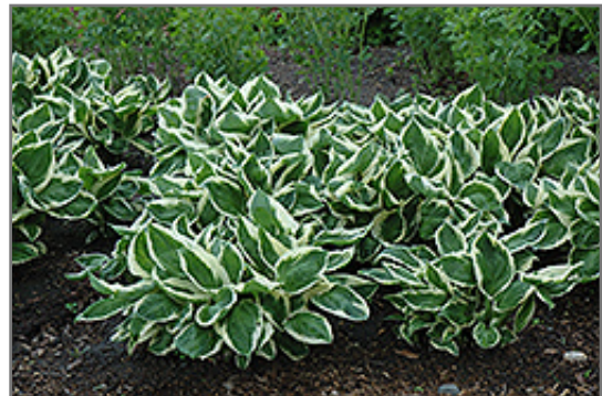
Minuteman Hosta