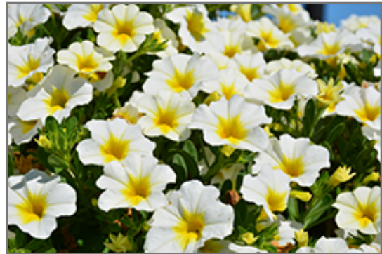
MiniFamous Neo White + Yellow Eye Calibrachoa flowers

MiniFamous Neo White + Yellow Eye Calibrachoa is a dense herbaceous annual with a trailing habit of growth, eventually spilling over the edges of hanging baskets and containers. Its medium texture blends into the garden, but can always be balanced by a couple of finer or coarser plants for an effective composition.