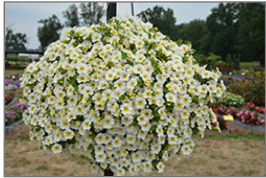
MiniFamous Neo White + Yellow Eye Calibrachoa in bloom