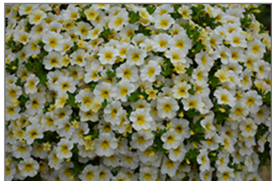
MiniFamous Neo White + Yellow Eye Calibrachoa flowers