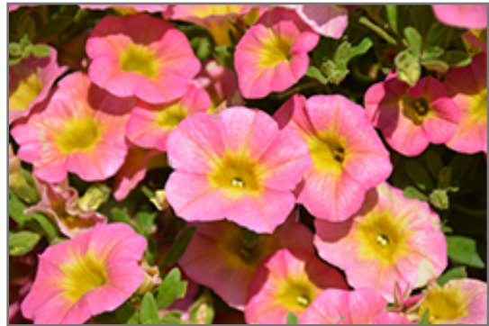
Callie Pink Morn Calibrachoa flowers

Callie Pink Morn Calibrachoa is recommended for the following landscape applications;