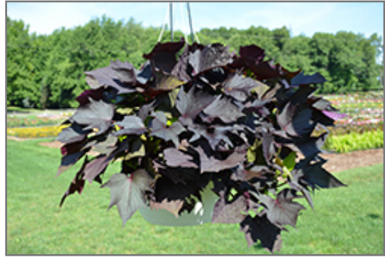
Sweet Caroline Bewitched After Midnight Sweet Potato Vine

Sweet Caroline Bewitched After Midnight Sweet Potato Vine is a fine choice for the garden, but it is also a good selection for planting in outdoor containers and hanging baskets. Because of its trailing habit of growth, it is ideally suited for use as a 'spiller' in the 'spiller-thriller-filler' container combination; plant it near the edges where it can spill gracefully over the pot. Note that when growing plants in outdoor containers and baskets, they may require more frequent waterings than they would in the yard or garden.