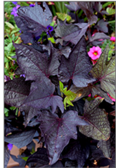
Sweet Caroline Bewitched After Midnight Sweet Potato Vine foliage

Sweet Caroline Bewitched After Midnight Sweet Potato Vine is recommended for the following landscape applications;