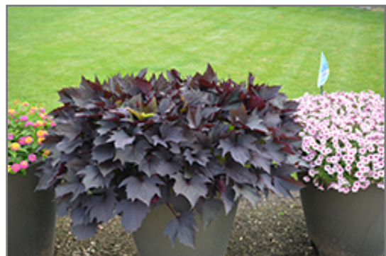
Sweet Caroline Bewitched After Midnight Sweet Potato Vine