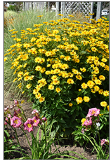
Summer Sun False Sunflower in bloom