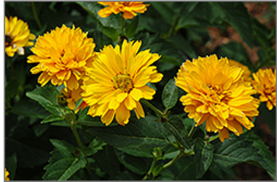
Summer Sun False Sunflower flowers

Summer Sun False Sunflower is recommended for the following landscape applications;