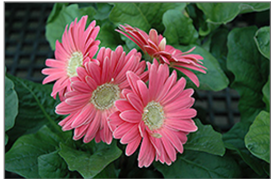
Pink Gerbera Daisy flowers

When grown indoors, Pink Gerbera Daisy can be expected to grow to be about 12 inches tall at maturity extending to 16 inches tall with the flowers, with a spread of 12 inches. It grows at a fast rate, and under ideal conditions can be expected to live for approximately 3 years. This houseplant will do well in a location that gets either direct or indirect sunlight, although it will usually require a more brightly-lit environment than what artificial indoor lighting alone can provide. It does best in average to evenly moist soil, but will not tolerate standing water. The surface of the soil shouldn't be allowed to dry out completely, and so you should expect to water this plant once and possibly even twice each week. Be aware that your particular watering schedule may vary depending on its location in the room, the pot size, plant size and other conditions; if in doubt, ask one of our experts in the store for advice. It is not particular as to soil type or pH; an average potting soil should work just fine.