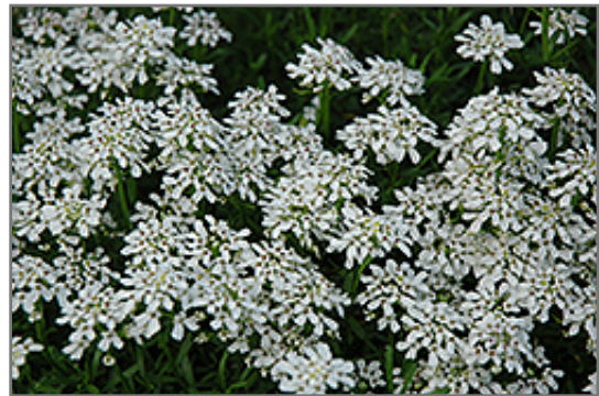
Little Gem Candytuft flowers