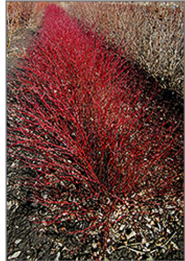
Little Rebel Dogwood in winter

* This is a 'special order' plant - contact store for details