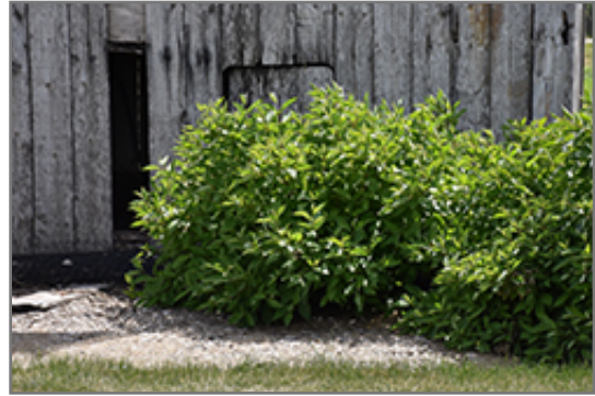
Little Rebel Dogwood