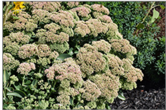
Autumn Joy Stonecrop in bloom