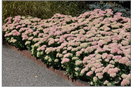
Autumn Joy Stonecrop in bloom

Autumn Joy Stonecrop is recommended for the following landscape applications;