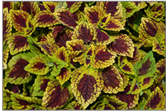
Stained Glassworks Raspberry Tart Coleus foliage