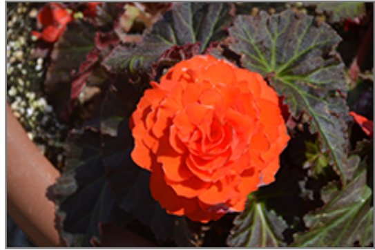
Nonstop Mocca Deep Orange Begonia flowers

Nonstop Mocca Deep Orange Begonia is recommended for the following landscape applications;