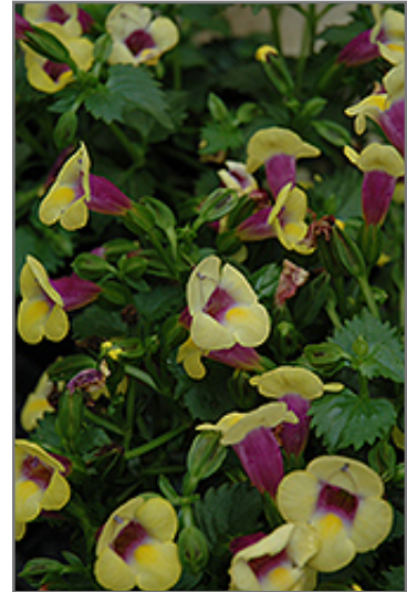
Yellow Moon Torenia flowers

Yellow Moon Torenia is recommended for the following landscape applications;