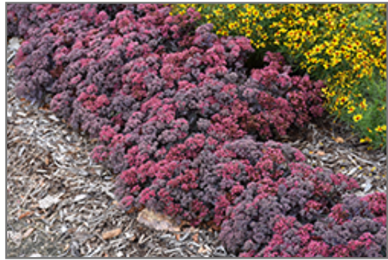
Dazzleberry Stonecrop in bloom