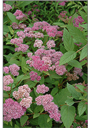
Froebelii Spirea flowers

This shrub will require occasional maintenance and upkeep, and is best pruned in late winter once the threat of extreme cold has passed. It is a good choice for attracting butterflies to your yard, but is not particularly attractive to deer who tend to leave it alone in favor of tastier treats. It has no significant negative characteristics.