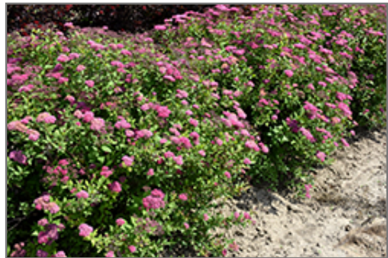
Froebelii Spirea in bloom