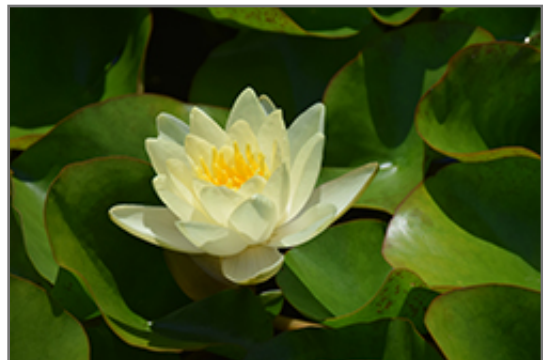
Marliacea Chromatella Hardy Water Lily flowers