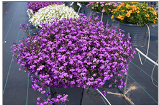
Techno Violet Lobelia in bloom