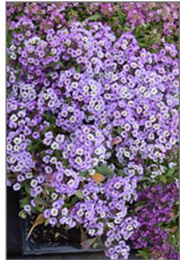
Clear Crystal Lavender Shades Sweet Alyssum flowers

Clear Crystal Lavender Shades Sweet Alyssum is recommended for the following landscape applications;