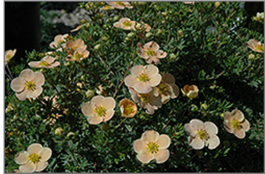
Day Dawn Potentilla flowers

Day Dawn Potentilla will grow to be about 3 feet tall at maturity, with a spread of 3 feet. It tends to fill out right to the ground and therefore doesn't necessarily require facer plants in front. It grows at a slow rate, and under ideal conditions can be expected to live for approximately 30 years.