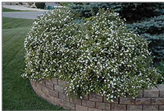
Abbotswood Potentilla in bloom