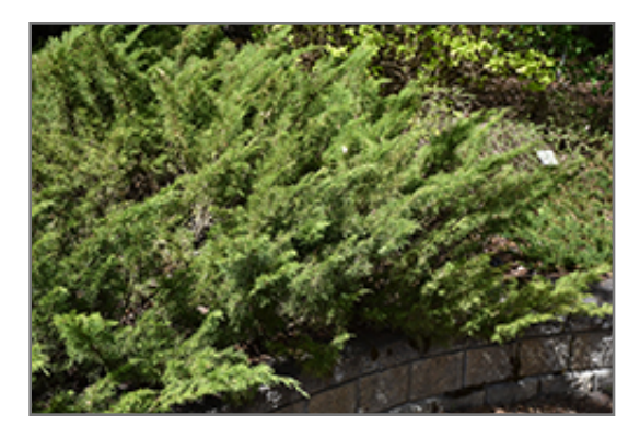
Skandia Juniper