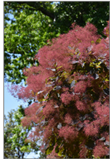
Grace Smokebush flowers