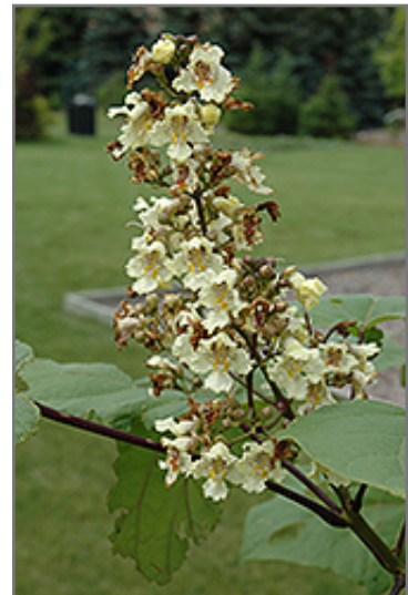
Chinese Catalpa flowers