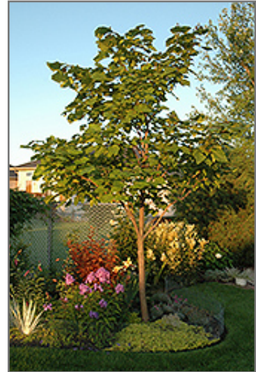
Chinese Catalpa