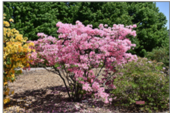
Northern Lights Azalea in bloom