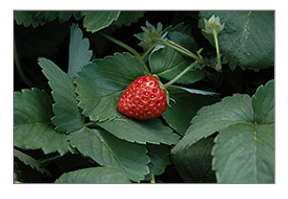
Fort Laramie Strawberry fruit

Fort Laramie Strawberry features dainty white daisy flowers with yellow eyes along the stems from late spring to mid summer. Its tomentose round compound leaves remain green in colour throughout the season. It features an abundance of magnificent scarlet berries from early to late summer.