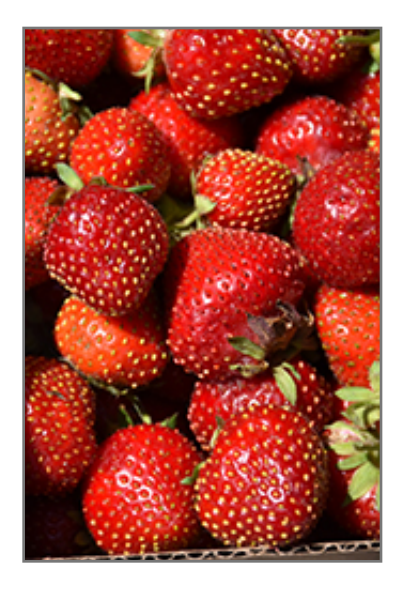
Fort Laramie Strawberry fruit

Fort Laramie Strawberry is a good choice for the edible garden, but it is also well-suited for use in outdoor pots and containers. Because of its spreading habit of growth, it is ideally suited for use as a 'spiller' in the 'spiller-thriller-filler' container combination; plant it near the edges where it can spill gracefully over the pot. Note that when growing plants in outdoor containers and baskets, they may require more frequent waterings than they would in the yard or garden. Be aware that in our climate, most plants cannot be expected to survive the winter if left in containers outdoors, and this plant is no exception. Contact our experts for more information on how to protect it over the winter months.