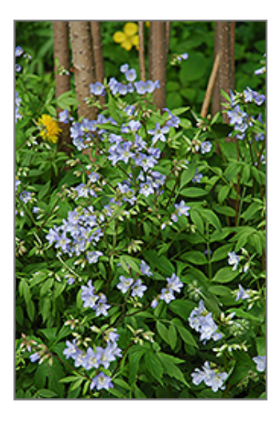
Creeping Jacob's Ladder flowers