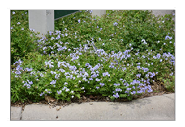
Creeping Jacob's Ladder in bloom