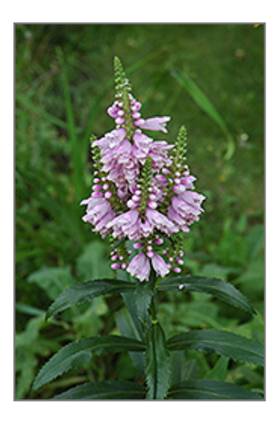
Obedient Plant flowers