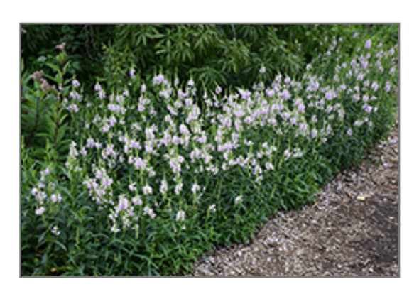
Obedient Plant in bloom