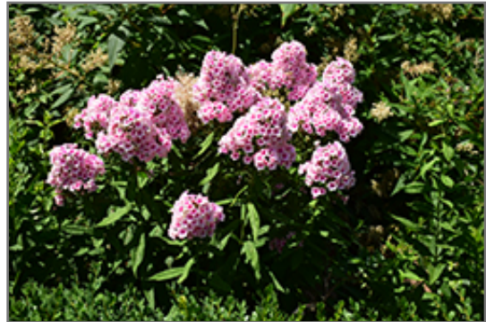
Bright Eyes Garden Phlox in bloom