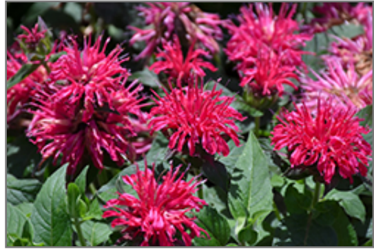
Balmy Rose Beebalm flowers