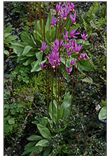
Shooting Star in bloom