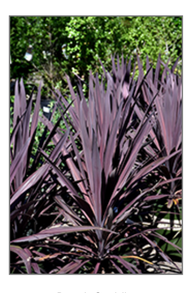
Bauer's Cordyline

When grown indoors, Bauer's Cordyline can be expected to grow to be about 6 feet tall at maturity, with a spread of 3 feet. It grows at a medium rate, and under ideal conditions can be expected to live for approximately 10 years. This houseplant will do well in a location that gets either direct or indirect sunlight, although it will usually require a more brightly-lit environment than what artificial indoor lighting alone can provide. It does best in average to evenly moist soil, but will not tolerate standing water. The surface of the soil shouldn't be allowed to dry out completely, and so you should expect to water this plant once and possibly even twice each week. Be aware that your particular watering schedule may vary depending on its location in the room, the pot size, plant size and other conditions; if in doubt, ask one of our experts in the store for advice. It is not particular as to soil type or pH; an average potting soil should work just fine.