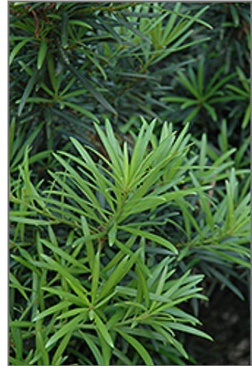
Japanese Yew foliage

When grown indoors, Japanese Yew can be expected to grow to be about 6 feet tall at maturity, with a spread of 3 feet. It grows at a slow rate, and under ideal conditions can be expected to live for approximately 50 years. This houseplant will do well in a location that gets either direct or indirect sunlight, although it will usually require a more brightly-lit environment than what artificial indoor lighting alone can provide. It does best in average to evenly moist soil, but will not tolerate standing water. The surface of the soil shouldn't be allowed to dry out completely, and so you should expect to water this plant once and possibly even twice each week. Be aware that your particular watering schedule may vary depending on its location in the room, the pot size, plant size and other conditions; if in doubt, ask one of our experts in the store for advice. It is not particular as to soil type or pH; an average potting soil should work just fine.