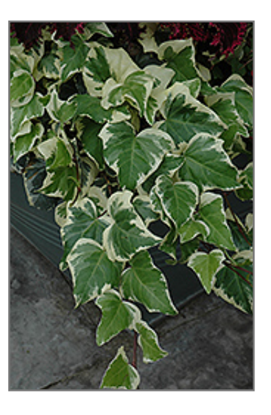
Gloire de Marengo Ivy foliage

When grown indoors, Gloire de Marengo Ivy can be expected to grow to be about 10 feet tall at maturity, with a spread of 3 feet. It grows at a fast rate, and under ideal conditions can be expected to live for approximately 30 years. This houseplant performs well in both bright or indirect sunlight and strong artificial light, and can therefore be situated in almost any well-lit room or location. It prefers to grow in average to moist soil. The surface of the soil shouldn't be allowed to dry out completely, and so you should expect to water this plant once and possibly even twice each week. Be aware that your particular watering schedule may vary depending on its location in the room, the pot size, plant size and other conditions; if in doubt, ask one of our experts in the store for advice. It is not particular as to soil pH, but grows best in rich soil. Contact the store for specific recommendations on pre-mixed potting soil for this plant. Be warned that parts of this plant are known to be toxic to humans and animals, so special care should be exercised if growing it around children and pets.